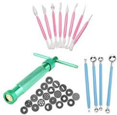
32 Pcs Clay Fondant Extruder Cake Decorating Supplies Sugar Modeling Tool, Clay Extruder Gun with 20 Tips Sugar Paste Extruder...