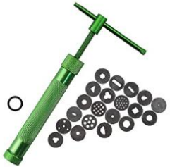
COMIART Clay Gun Extruder with 20 Unique Disc for Pottery Ceramic Craft Polymer Sculpture Modeling Fondant Cake