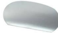
Flexible Metal Clay Scraper - 4"