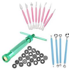
32 Pcs Clay Fondant Extruder Cake Decorating Supplies Sugar Modeling Tool, Clay Extruder Gun with 20 Tips Sugar Paste Extruder... ★★★★★ (22) $14.99