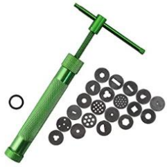
COMIART Clay Gun Extruder with 20 Unique Disc for Pottery Ceramic Craft Polymer Sculpture Modeling Fondant Cake ★★★★★ (614) $11.99